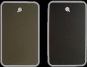
PISTON TOP COATING